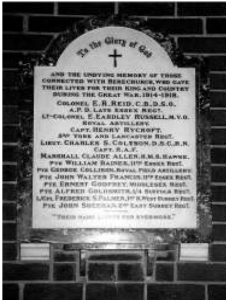
Casualty Type: Commonwealth War Dead Cemetery: BERECHURCH (ST. MICHAEL) CHURCHYARD